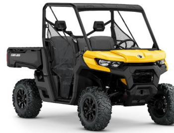
DPS | HD10