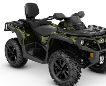
XT | 650