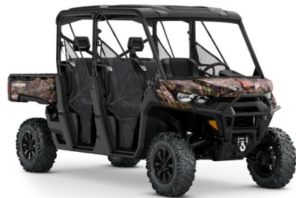
XT | HD10