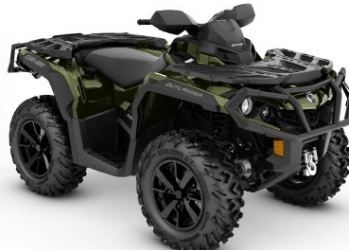
XU | 650, 1000R