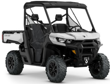
XT | HD10