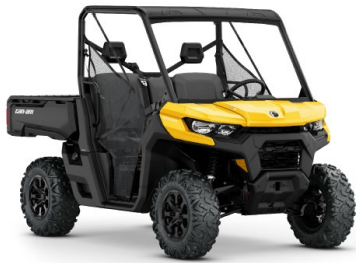
DPS | HD8