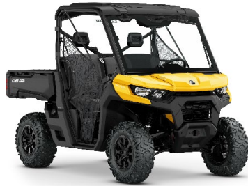
XU | HD8