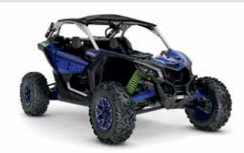
MAVERICK X3 X rs