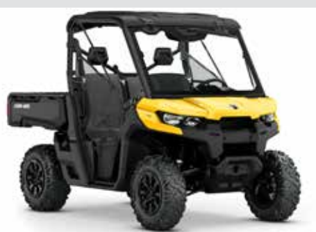
DEFENDER PRO (PACKAGE)

Torture-tested to dominate changeable conditions, this workhorse is mud-ready from winch to tail, including snorkeled intakes and Smart-Lok.