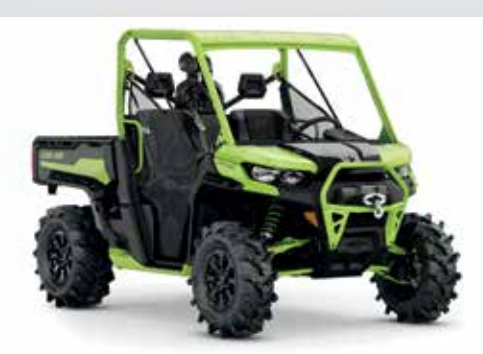
DEFENDER X mr